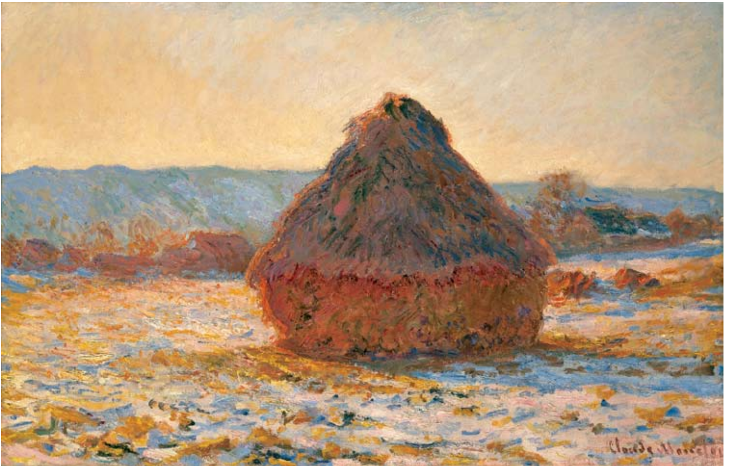
Grainstack in the Sunlight, Snow effect, 1891. Lent anonymously