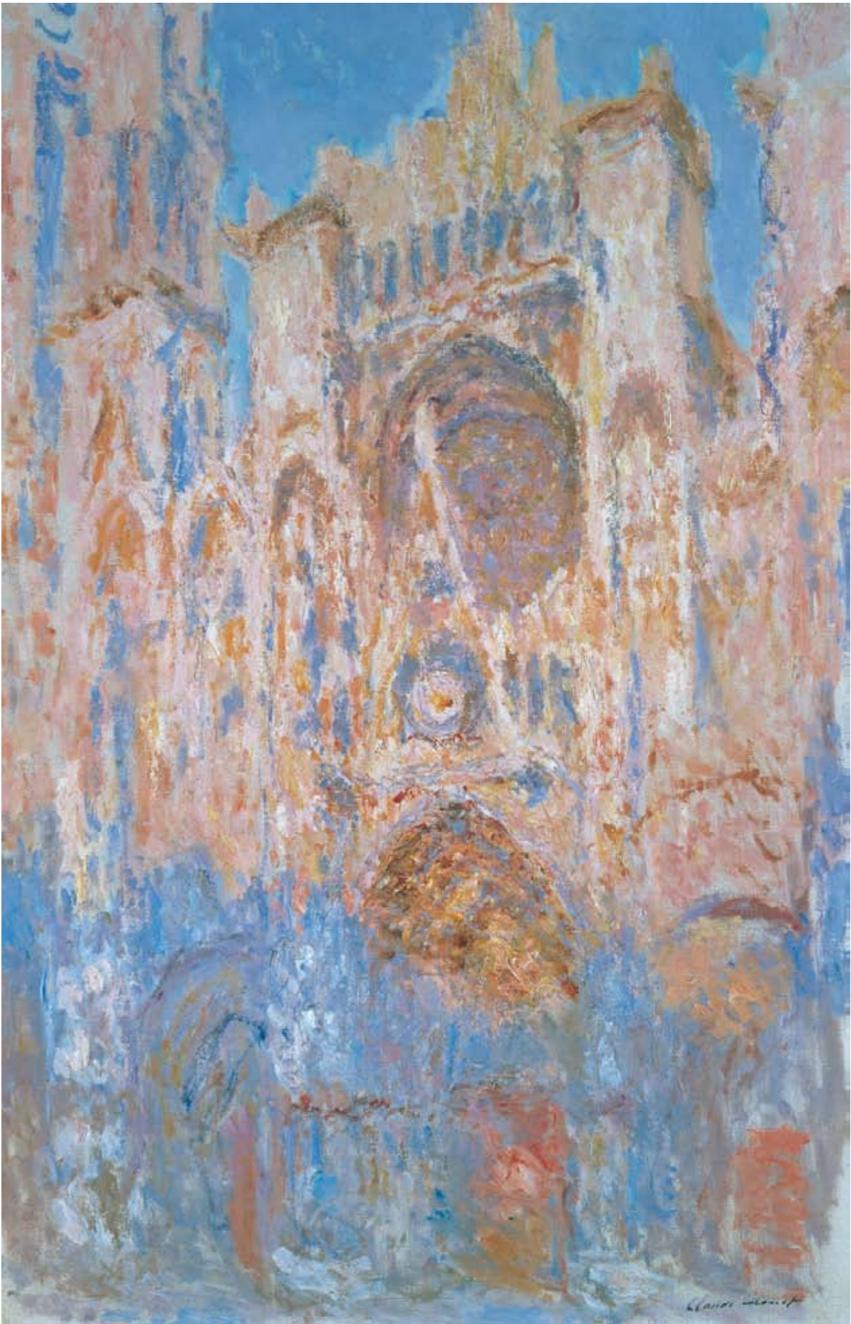
Rouen Cathedral, Sunlight Effects at Day's End, 1892. Musée Marmottan Monet, Paris