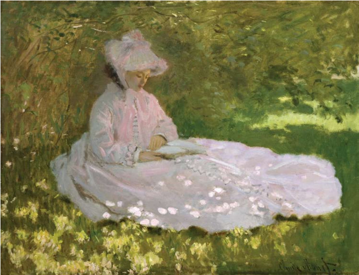
Woman Reading , 1872. Walters Art Museum, Baltimore, MD