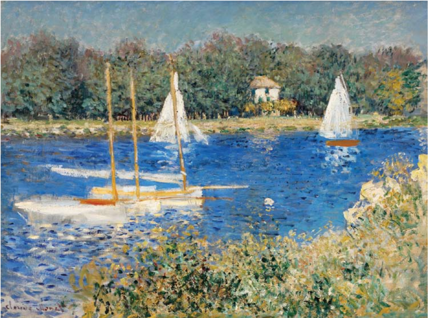
The Seine at Argenteuil , 1874. The RISD Museum, Providence, RI